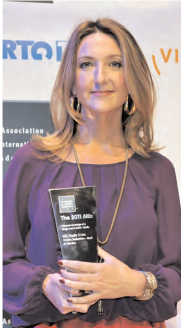
Victoria Derbyshire, BBC Radio 5 Live - Clearest coverage of a single news event (Radio)