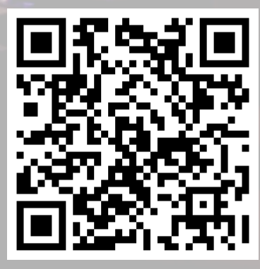
To reserve your seats at the AIBs 2024, scan the QR code or visit www.theaibs.tv

Join us on 22 November to celebrate the work of teams and colleagues from around the world at the 20th annual AIBs .