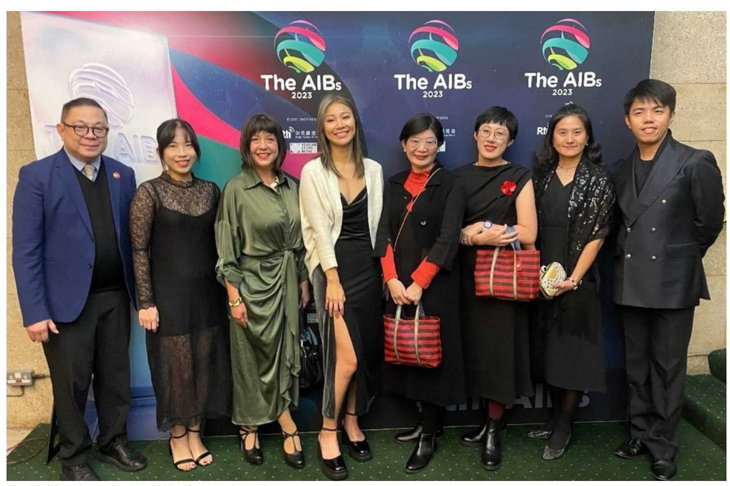
The Rti delegation to the AIBs 2023 gala events in London